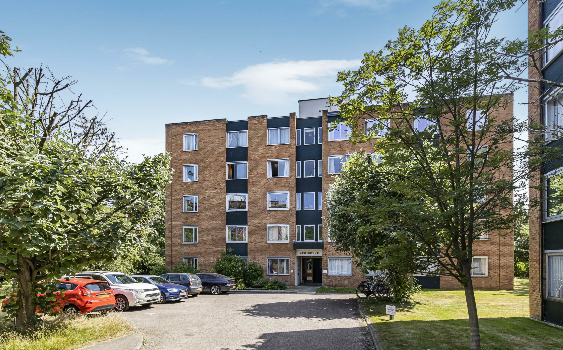
Marlborough Court, Cambridge, CB3 9BQ